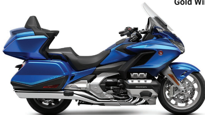
Gold Wing Tour Airbag DCT