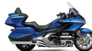
Gold Wing Tour Automatic DCT