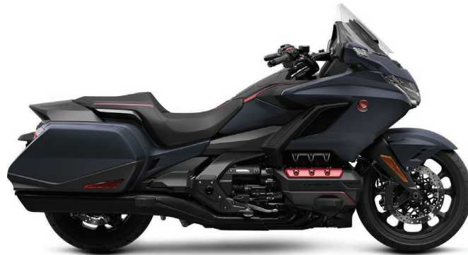
Gold Wing Gold Wing DCT