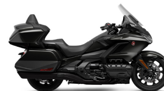
Gold Wing Tour