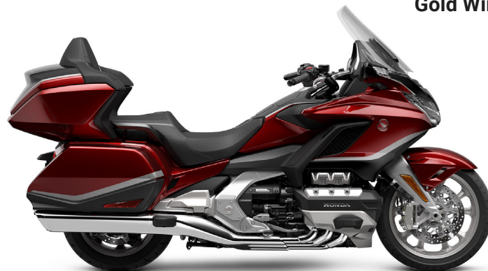
Gold Wing Tour Airbag DCT