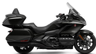
Gold Wing Tour Automatic DCT