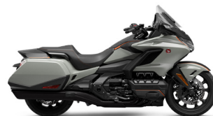
Gold Wing Automatic DCT