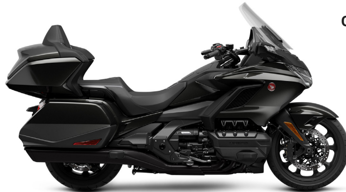
Gold Wing Tour Gold Wing Tour DCT