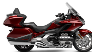
Gold Wing Tour Automatic Air Bag DCT