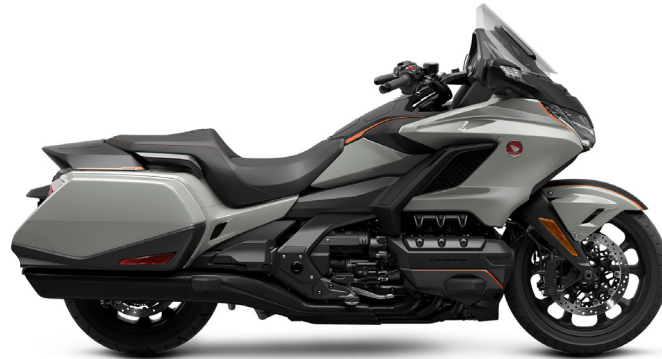
Gold Wing Gold Wing DCT