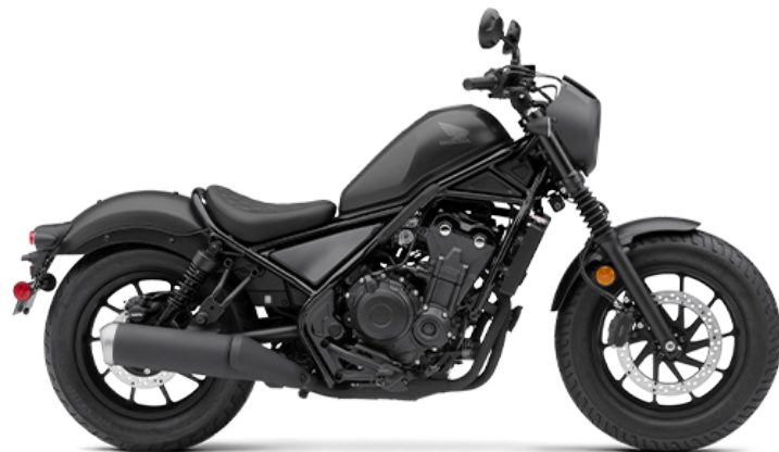
2021 Rebel 500 ABS SE