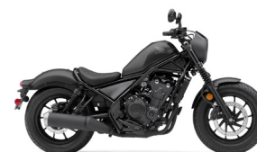
Rebel 500 ABS SE